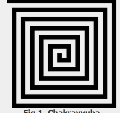
Fig 1. Chakravyuha

A Chakravyuha is a wheel-like formation. Pictorially it is depicted as below